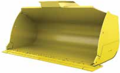
Material Handling Bucket